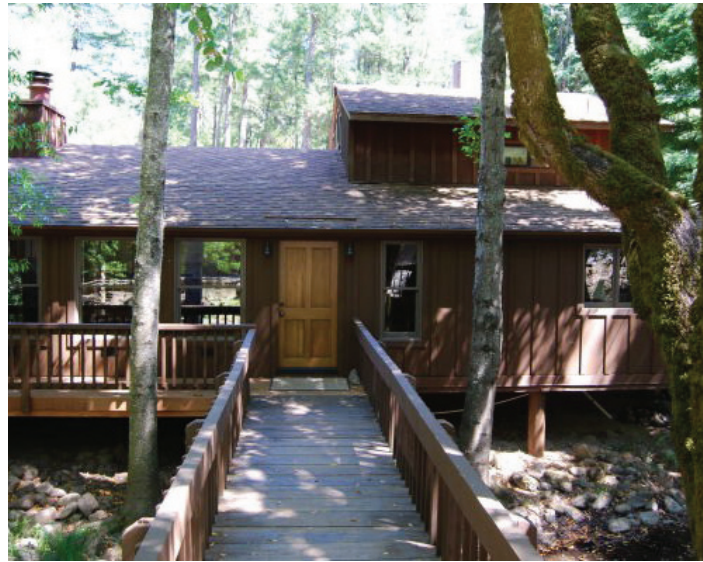
Peter Michael Winery has donated wine, tour and a two-day stay for six at the "cabin" on their Knights Valley estate.

Adding to the fun will be wine tasting hosted by