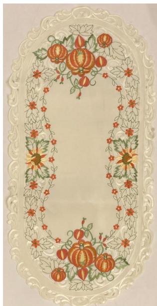
Table runners- perfect for Fall and Holiday decorating.

You asked-- We listened! Exclusive Museum notecards in 2 styles for your corresponding pleasure!