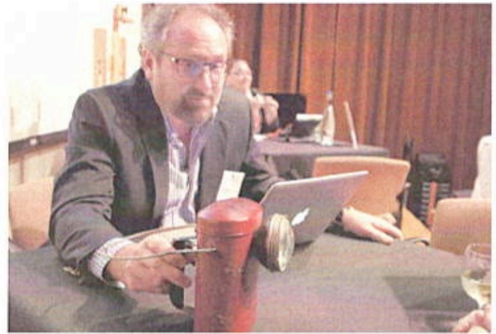
Clars Auction Gallery returns May 10 for another very popular art and antiques roadshow at the museum.