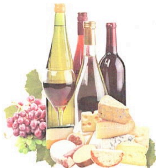
Instant Wine Cellar takes place Saturday, Aug. 24 from 4-7 p.m. at BGC gym.