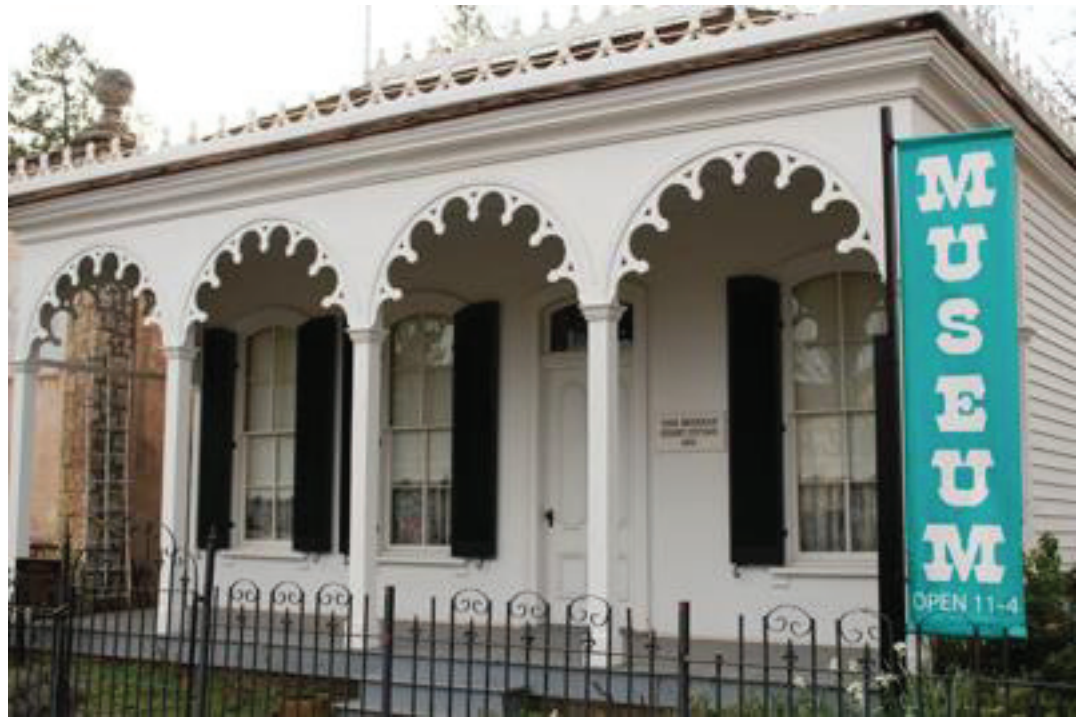
Today the Sam Brannan Cottage is an integral part of the historical experience guests enjoy every day.

It meant acquiring more property-- there was less than an acre of land on the premises and that was insufficient even for light parking and picnicking. They expected to have a donation of several hundred extra acres there and when that came about they would consider it more closely. In the meantime, the promise of more land had its complications and never went through. It was suggested that perhaps we would accept a place or acreage so to speak and bought it for the Park for such a museum. They were very eager for us to have it and very eager to participate.