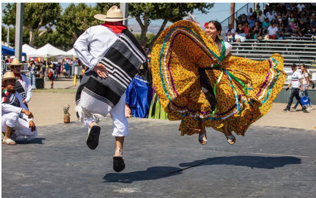
To kick off the Sharpsteen Museum's latest special exhibit celebrating Calistoga's Mexican Heritage, the Ballet Folklórico "El Valle" St. Helena will perform on Mother's Day.

We are excited to celebrate the richness of this cultural heritage with local residents and visitors alike, through universal themes of Family, Work, Celebration (to be represented by a Dia de los Muertos Altar), History, Handcrafts & Textiles, as well as personal memories. The exhibit will run from May 1 – Oct. 31.