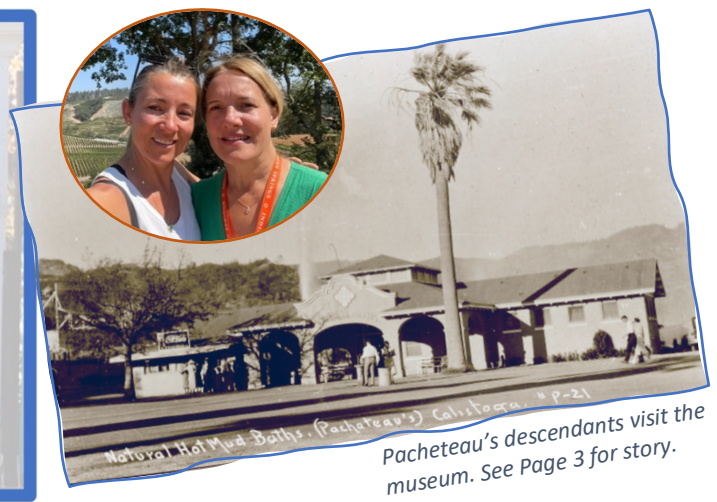
Pacheteau's descendants visit the museum. See Page 3 for story.