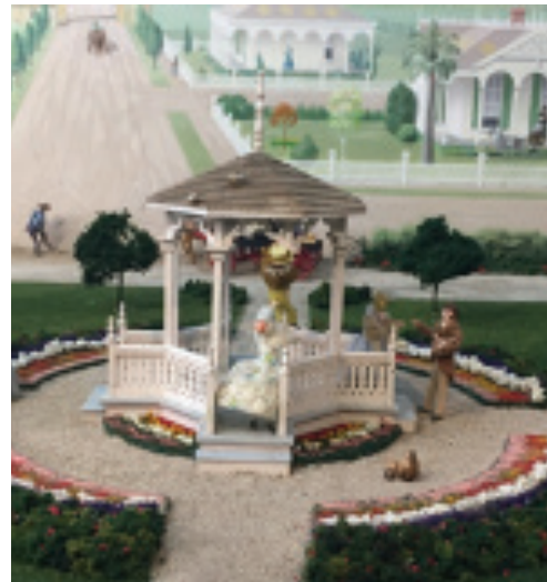
The gazebo in the main diorama.