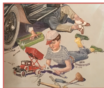
Continued on Page Three From the cover of The Restorer .