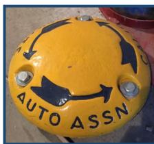
Can you identify this relic from Calistoga's past?